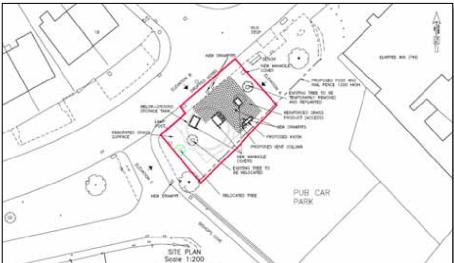
The current plans for Wessex Water’s engineering works at the junction of Highridge Road and Bishops Cove

We were contacted in April by Wessex Water who were planning to do some essential work at the junction of Bishops Cove and Highridge Road, where there have been problems in the past with sewers overflowing when heavy rainfall floods the combined pipes. Wessex Water are always excellent at pre-application consultation, and they were very co-operative when we met on site with relevant Council officers and discussed how to deal with the new trees which we had had planted as part of our long-term ‘Elm Tree Corner’ project. They also tried to co-operate with the manager of the ‘Elm Tree’ pub, by agreeing to put in a fence along the edge of the pub car-park. No problem there, but the current boundary