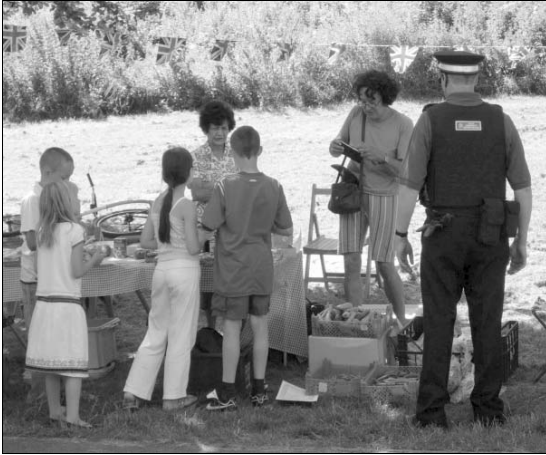
'Small riot, not many arrested'? No, just our new PCSO coming to say hello, and finding much of interest at the Food for All stall