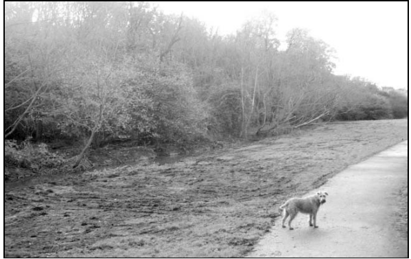
The mud will disappear - the stream is now clear!

T HOSE of you who regularly go to Manor Woods Valley will have noticed that recently the Council contractors have cleared the stream of branches near the pond. The main channel had been blocked for quite a few months and we had put pressure on the Council to clear it.