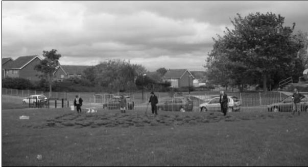
Above: Looking north across Kilmersdon Road