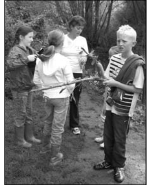
On the trail. Left: children of all ages looking for life on dead wood. Right: finding clues and making a map-stick

compass, the group sought a variety of clues and collected their mementos to take home. There were much-needed tea breaks between the three events when the teams changed over in the church hall which was very kindly made available again. It was clear how much the children enjoyed the chance to paddle in the stream, scabble in the woods and discover just what a wealth of interesting trees, fruits, nuts, flowers and small wildlife was to be found in this bit of urban jungle.