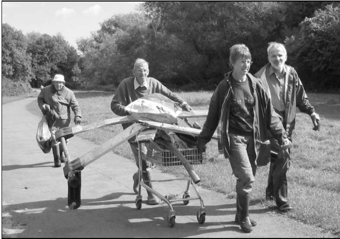
Left: No, it's not an autogiro