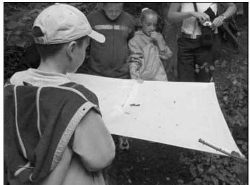
In the woods. Left: data logging. Right: bug collecting

For many of them it was a first experience of activities which earlier generations would have taken for granted: picking up pretty autumn leaves, fishing for tiddlers in a stream, collecting fruits or conkers, or just playing outdoors. Many children asked sensible and interesting questions about what they were seeing or discovering and I am sure all of them will want to get their boots on for another adventure in Bristol's secret green spaces.