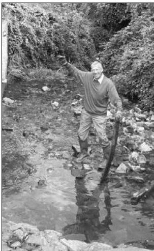
Bottom right: It was us wot dun it