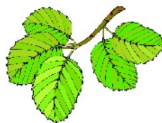
MANOR WOODS VALLEY GROUP

Wednesday 11 September: MANOR WOODS VALLEY GROUP MEETING at Zion, Bishopsworth Road, starting at 7.00pm. Presentations, discussion, decisions. Open to all. More information at www.manorwoodsvalley.org .