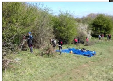
Working for Slow-worms