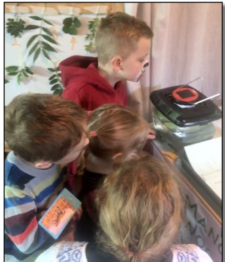
All eyes on the pond life tank at the Zion Children's Festival

Following the very successful soil research projects carried out by Bristol University geography students in the autumn, we are now in discussion with the School of Biological Sciences about potential research projects for their students this coming autumn. Also on the theme of 'learning', we had a 'discovery' stall at the Zion Children's Festival.