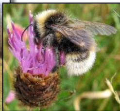
Wild flower meadow re-creation