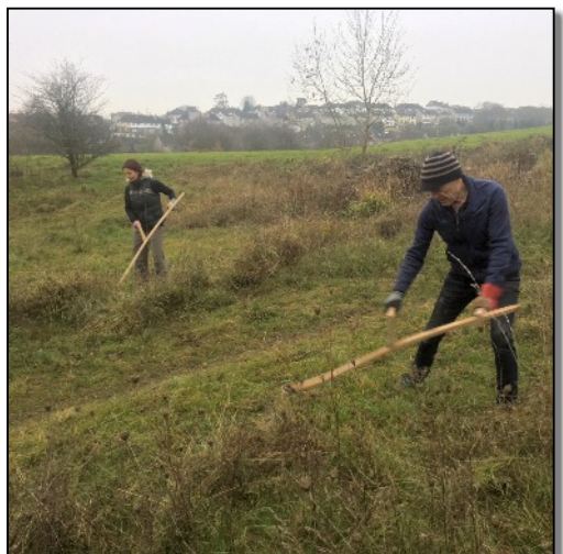
Wildlife friendly grass cutting