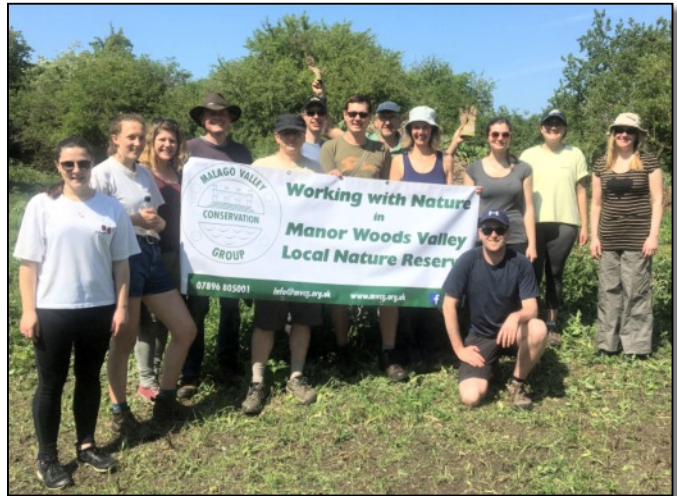
University of Bristol students and Environment Agency staff volunteers celebrating the end of a hard day's work in the Orchard