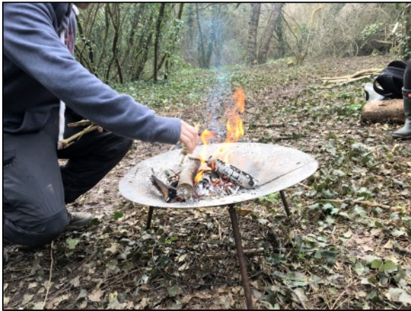
Getting ready for the lunch break on the Mindfulness course

The Forest of Avon Trust are continuing, over the summer months, with their very successful ‘Mindfulness’ courses in Manor Woods. Course members, from the Bristol Rehabilitation Service, learn woodland craft and cooking skills as well as identifying wild flowers, trees and birds.