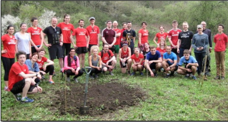
GoodGym runners and local volunteers in the Orchard