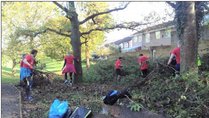
Path cleared for people; environment improved for wildlife

Woodland Path: Our priority for the Woodland this winter is to tackle the vegetation (mostly bramble, blackthorn and hawthorn) that is encroaching on the Woodland Path and, in places, threatening access and the enjoyment of walkers. We made a good start on the morning of Saturday 28 October when, again with the help of the GoodGym runners, we cleared the path near the interceptor storm drain and opened up a new glade. Our next working party on the Woodland Path, again with GoodGym, will be on Saturday 2 December from 10.00am to 1.00pm: please join us and experience the joy of working outdoors with nature.